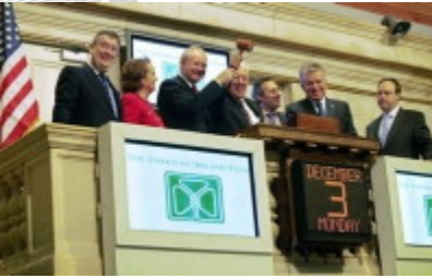
Dr Paisley and Martin McGuinness in New York Stock Exchange, Dec '07