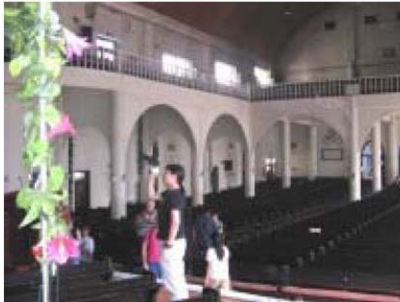
The inside of a government controlled church

Two Free Presbyterians, who are seeking to carry out missionary labours from a base near Beijing in China have sent the following report.