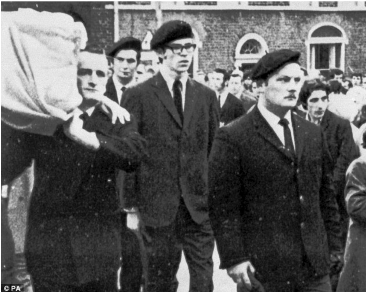
Gerry Adams (centre) pictured attending an IRA funeral during the troubles