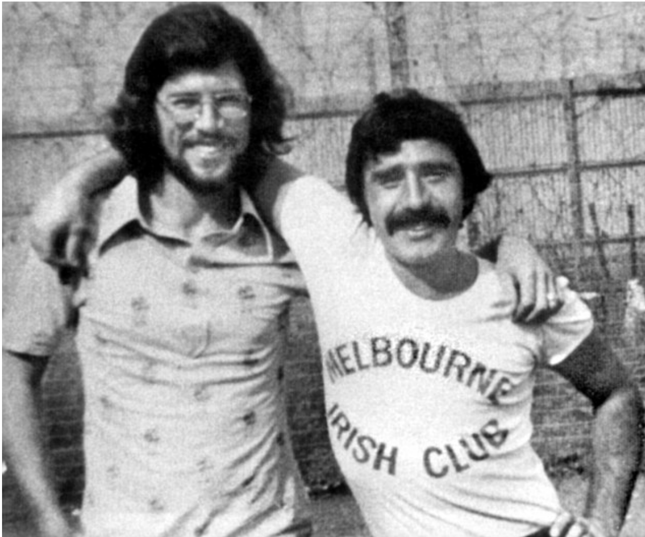
Gerry Adams with one-time friend Brendan 'Darkie' Hughes, who was a deputy commander of the IRA's Belfast Brigade and also insisted it was Adams who signed the Catholic Belfast housewife's death warrant

Price admitted. 'Some, I knew their fate, some I didn't. I took seven in all. My job was to hand them over to others. I don't even remember some of their names.