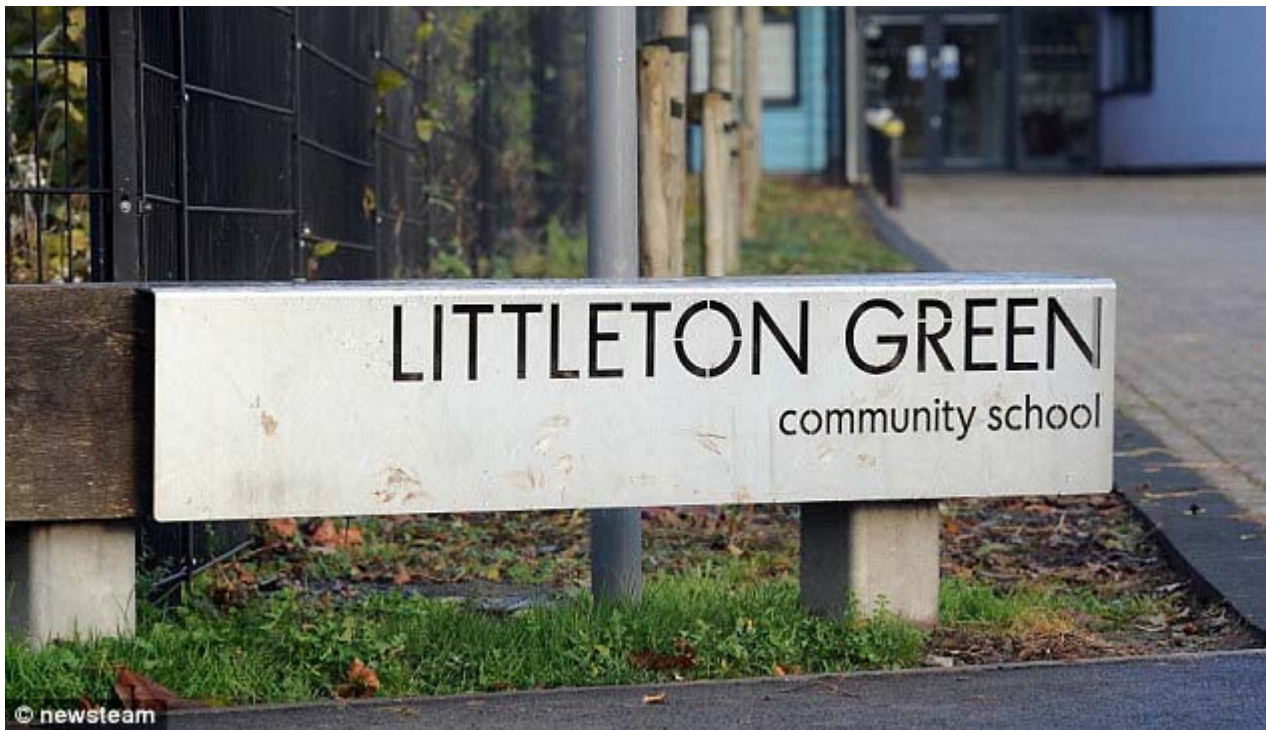
Littleton Green community school in Huntington, Staffordshire, was told it 'required improvement' by Ofsted

But after parents contacted the school and council chiefs intervened, they were then forced to make a U-turn.