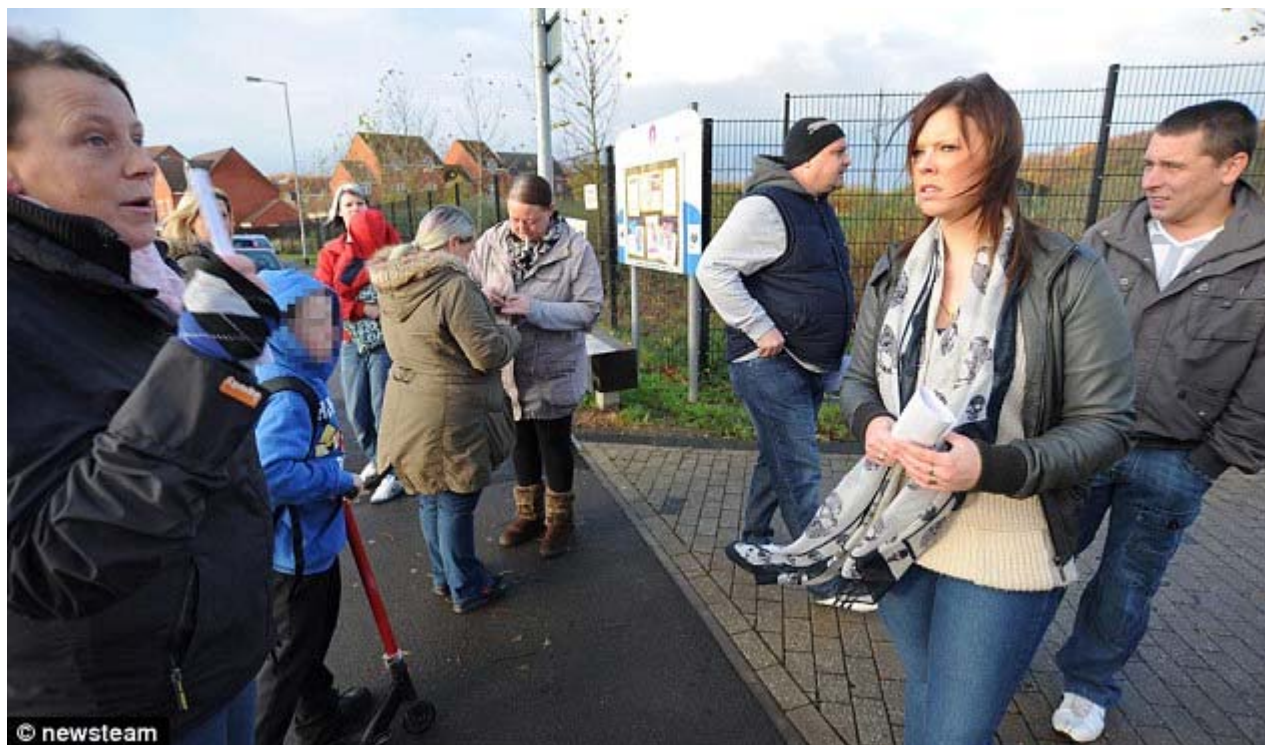
Angry parents outside Littleton Green School - they say their children should not be branded racist if they don't go

Littleton Green: The children from the primary school in Huntington are due to go on the trip next week