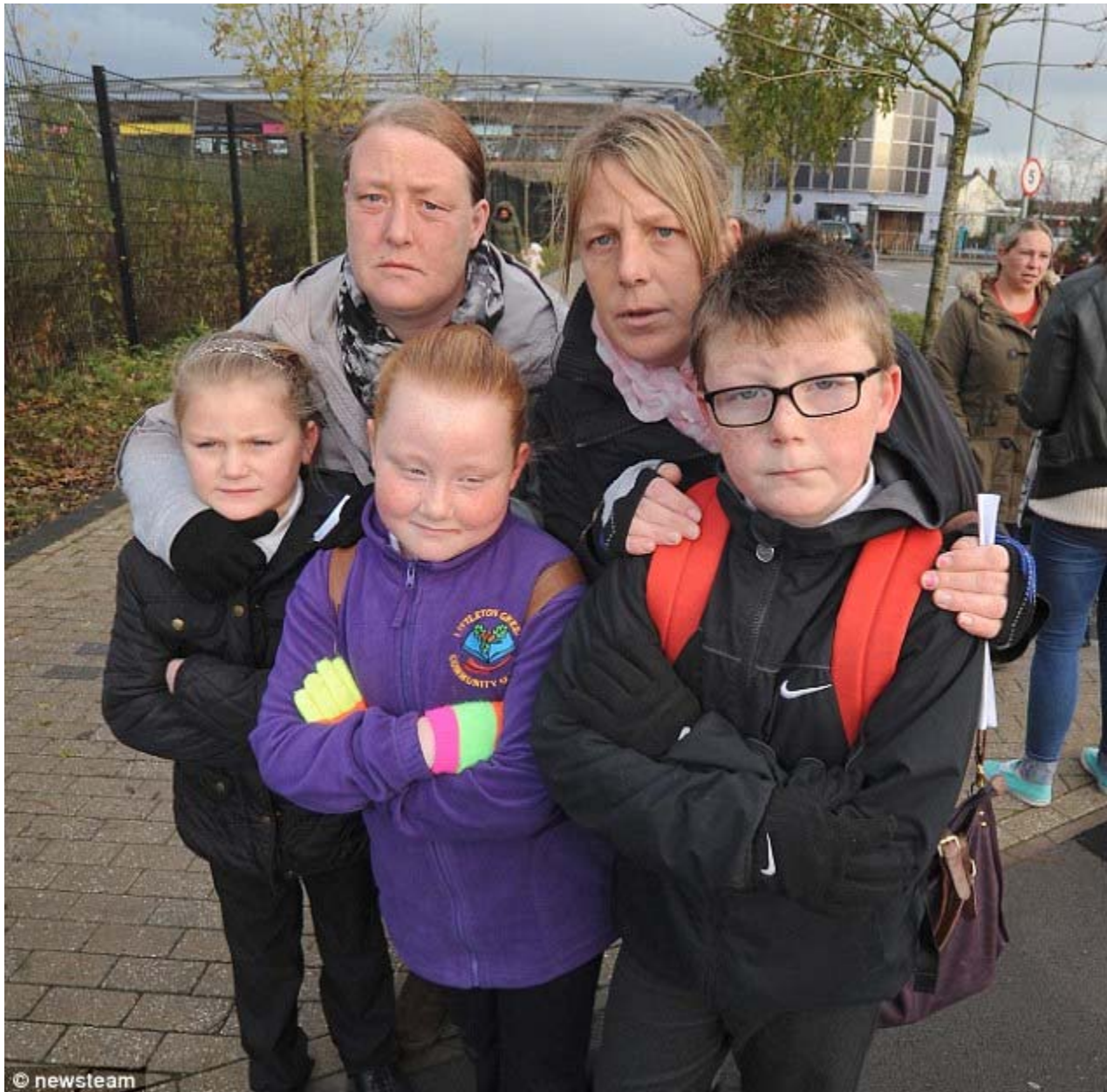
Parents accused Littleton Green community school of 'blackmailing' children to go to a workshop on Islam