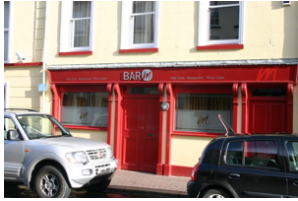
The "B-M" where Enniskillen Methodist church has convened "gospel meetings"

The following article appeared in "The Impartial Reporter", a County Fermanagh weekly newspaper, of September 22nd.