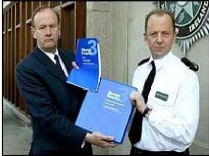
Sir John Stevens and the Chief Constable, Hugh Orde, at the launch of the “Steven’s Report.”