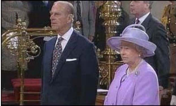
The Queen and Prince Philip