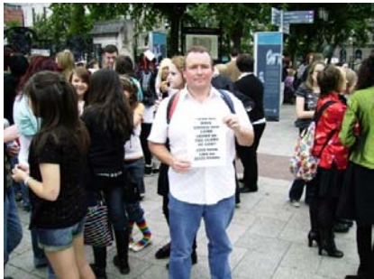
Gospel literature distributed

On March 22nd 2007, it was announced by OFMDFM that the short term funding package of £100,000 announced by Peter Hain on 29th July 2006, would be increased to a total of £230,000 which will end in the Summer of 2008. The first payment of £100,000 covered the period January 2007 to March 31st 2007. This was stated in a letter from