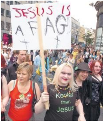
The blasphemous placard carried in a parade grant-aided by the present DUP-Sinn Fein/IRA coalition government!

It has been said that we must never elevate our opinion, on a political initiative or policy which is not directly and clearly legislated upon in God's Word, to such a degree that we judge others by our opinion in the way that we should only measure actions and attitudes by God's Word. That is a true and wise saying.