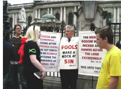
Free Presbyterians protesting against sodomite parade in Belfast

On Saturday, August 4th, a parade glorying in the wickedness of sodomy took place in Belfast. It was the "Gay Pride" parade. One of those taking part carried a poster which was so offensive to Christians that I hesitate to give its wording. What made the matter even more offensive is the fact that such an event is funded by the DUP-led coalition and administered directly by the departments held by Dr Paisley and another Christian, Edwin Poots.