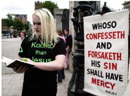
Carrier of blasphemous placard being shown Romans chapter 1.