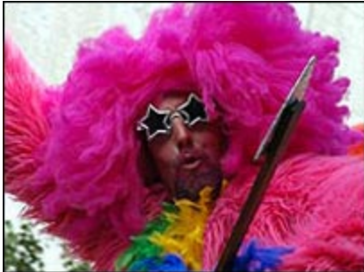
Belfast sodomite parade

" . . . choose you this day whom ye will serve . . . . but as for me and my house, we will serve the LORD," Joshua 24:15.