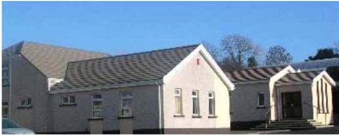
Kilskeery Free Presbyterian Church & School

◆————◆ “The Word of God and the 39 Articles disregarded in the search for ‘Christian Unity’ — is this of God?”