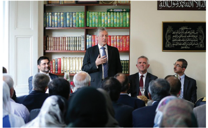
Peter Robinson apologised to Muslim leaders in their Belfast Islamic Centre on 4th June, 2015.

To be quite honest, singing the hymn, "I'm not ashamed to own my Lord" outside the court, seemed a little incongruous given the behaviour of Pastor McConnell in the wake of his making of the comments.