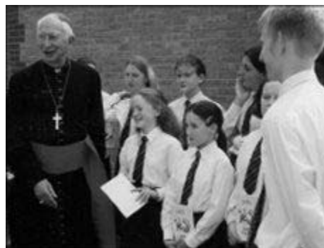
The late Cardinal Hume

In Britain, Cardinal Basil Hume, Archbishop of Westminster, wrote a warm message of welcome to hundreds of delegates attending three Catholic Alpha conferences held in Westminster Cathedral Hall. And during an official visit to the Convent of Jesus and Mary Language College in Willesden, north London, in 1997, he spoke with schoolchildren attending a Youth Alpha course there.