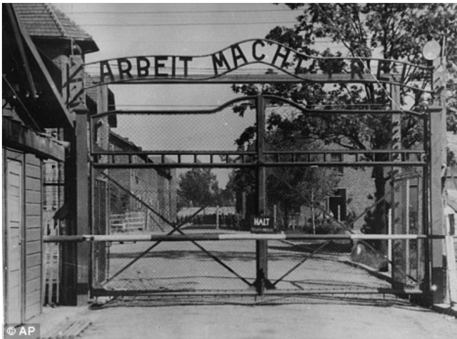
Offence: Cardinal Pell suggested Germans had suffered more than Jews during the Holocaust in which million were killed at concentration camps such as Auschwitz, pictured

He said: 'He (God) helped probably through secondary causes for the Jews to escape and continue. It is interesting through these secondary causes probably no people in history have been punished the way the Germans were. It is a terrible mystery.'