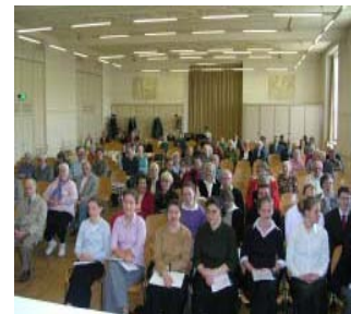
Some of those who attended the conference with members of a young people’s choir from the “Friedensstimme Mission” sitting in the front

1. Jude said that it was “needful” for him to speak so. The Greek word carries the meaning of being “encircled in the arms of necessity.” He was compelled to issue this warning. The word is translated “distress” in 1 Thess 3:7. “Therefore, brethren, we were comforted over you in all our affliction and distress by your faith.” Jude was distressed and imprisoned by an urgent need to issue a warning to God’s people about the danger they faced. Would God we had more ministers who felt this distress of mind and soul for God’s people in these evil days. There is a time for the shepherd to become a soldier, as did David when the lion and the bear attacked his flock. “And David said unto Saul, Thy servant kept his father’s sheep, and there came a lion, and a bear, and took a lamb out of the flock: And I went out after him, and smote him, and delivered it out of his mouth: and when he arose against me, I caught him by his beard, and smote him, and slew him,” 1 Samuel 17:34-35. The war in Iraq has turned some of my fellow Ulstermen who are army reservists, from mechanics, butchers, carpenters into soldiers, as they have been called up for service by our government. God is calling for His servants to arm themselves as soldiers and go forth to meet those who threaten His flock.